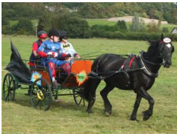
Casse and the Bat-mobile