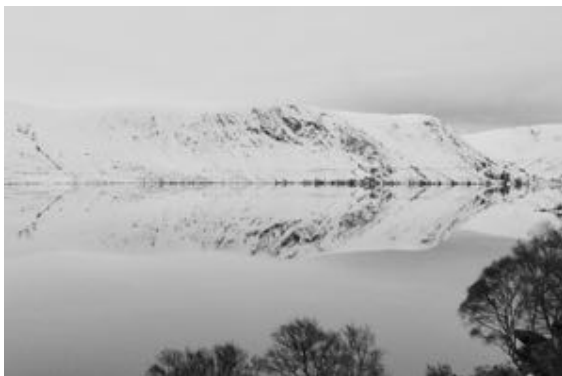
Loch Muick 13 th March